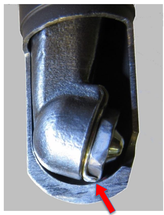
Figure 1, Section Views Showing Extra Material Location and Potential Contact Location with Sheath and Duplex Adapter

Service Bulletin No: 141125-001 Revision: Original Date: Dec 1, 2014